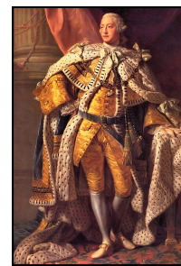
← King George III

Montesquieu studied the laws, customs, and governments of European countries to see how they created and enforced laws. He admired the government of England. The English government had three parts: a king to enforce laws, Parliament to create laws, and courts to interpret laws. The government was divided into parts, and each part had its own purpose. Montesquieu called this the separation of powers .