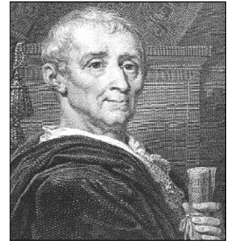
Baron de Montesquieu

Charles Louis de Secondat was born in 1689 in the city of Bordeaux, France. At age 27, he became Baron de Montesquieu (MON-teh-skew) when he inherited his uncle's fortune and title. Montesquieu was one of the great thinkers of the 17th and 18th centuries. He spent a lot of time thinking about how governments should be created and maintained. His ideas guided the Founding Fathers when they wrote the United States Constitution. Even today, Montesquieu's thinking influences the way people think about government around the world.